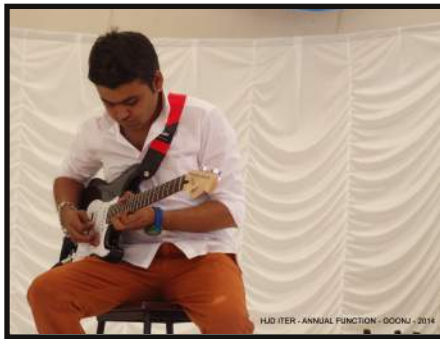
Performance on Guitar