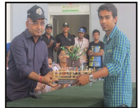
Model of our College made by Student