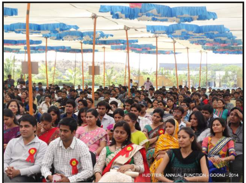
Audience Enjoying Performances