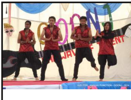
Group Dance by Students