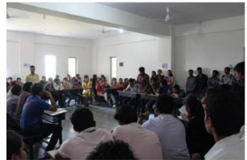
Group Discussion Group discussion on various topics