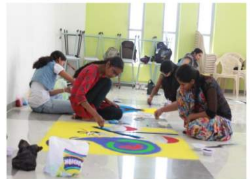
Rangoli Rangoli competition

International Women's Day, which has existed for more than 100 years, was the product of an era marked by rapid change and upheaval in the industrialized world. As the planet's population grew and the demand for labor increased, and as new ideologies took shape, women were thrust into a brave new world and confronted with a host of challenges.