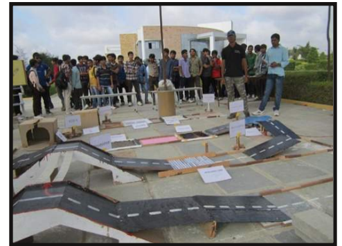
Track for Robo Race