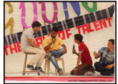
Drama Performance by Students