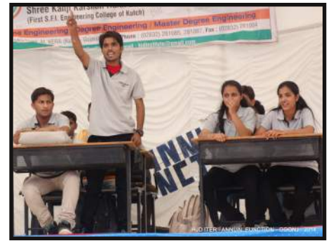
Drama Performance by Students